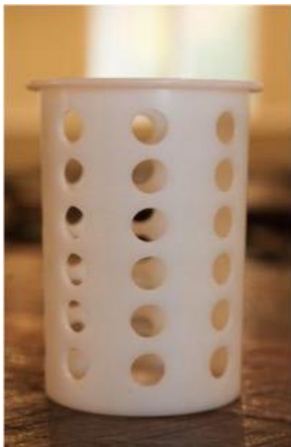
The White Hole Thing makes our hearts sing and is also the way we gather utensils

Meals at camp are a symphony, and like every good symphony, conductors are necessary! At camp, the counselors hold the baton. You should not underestimate the importance of meals at camp. Children identify meals with their families, but veteran campers identify camp meals in Tucker Inn with their friends, so mealtimes can foster homesickness or friendship. The difference is a comfortable order that only the counselor can make happen. Here is how we make that order.