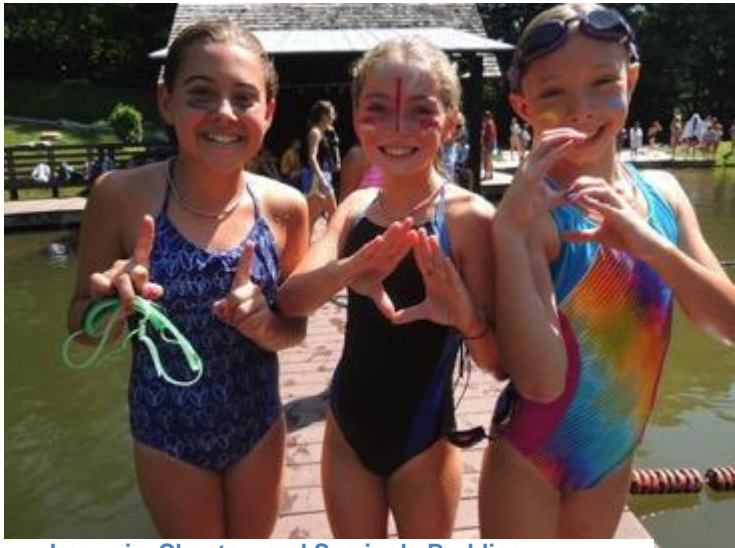
Iroquois, Choctaw and Seminole Buddies