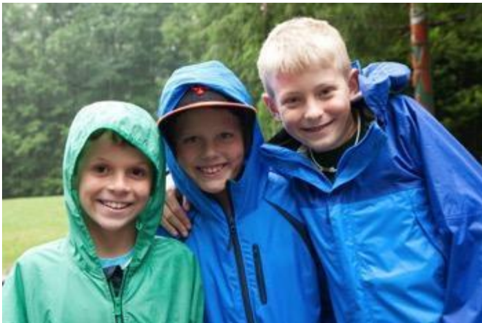
Rainy day friends are best at camp

The Carolina Mountains are, on occasion, subject to long periods of rain, but this is an outstanding opportunity for our value ‘we care about details’ to shine. Our littles need help keeping feet dry; lines need to be cleared and dried; classes MUST meet in rainy day locations. Remember, do not dismiss campers to their next class if Thor Guard has gone off, and make sure they are wearing rain gear. These are the details that take an average camp experience and make it exceptional.