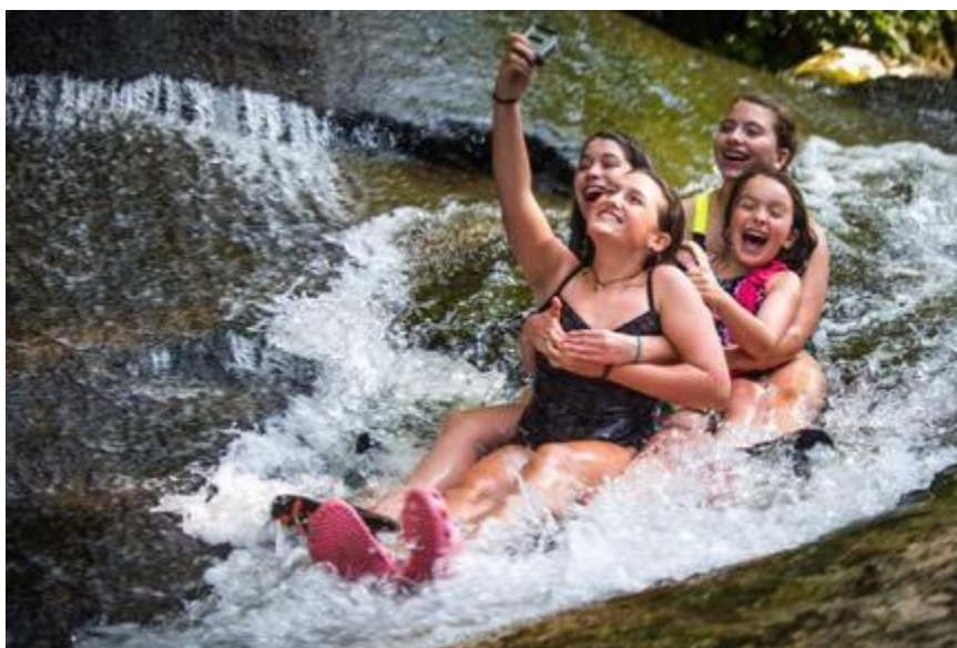
A perfect day for fun at Lower Creek Falls

An aquatic site will be defined as any event where a camper will be in water over his/her thigh. By this definition a river ford may be an aquatic site.