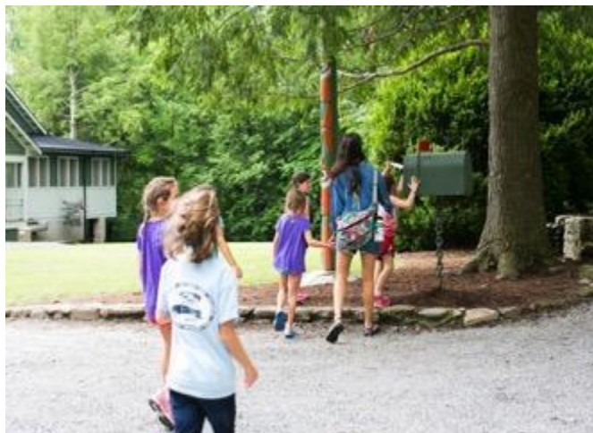
Girls mailing letters before their meal in Tucker inn

cardboard from packages is not allowed in cabins as the glue in these boxes attracts everyone's favorite pest...cockroaches.