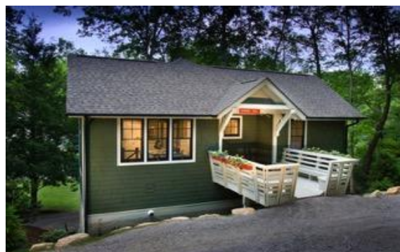
The Wishing-Well is a great place to feel better

At the first sign of any sickness, bring your camper to the Wishing-Well. This is our infirmary and is staffed by four health care providers. Remember that they are the experts about camp health, and you are the expert about your camper, so tell them when you feel they should take a closer look at your camper.