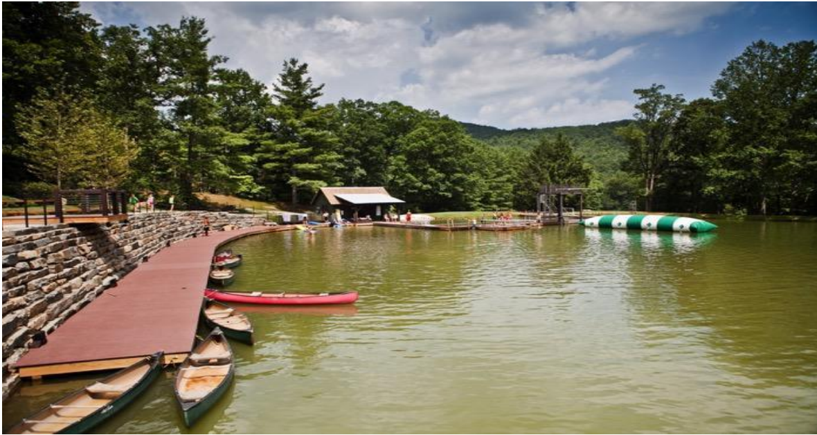
A perfect day on Lake Doris