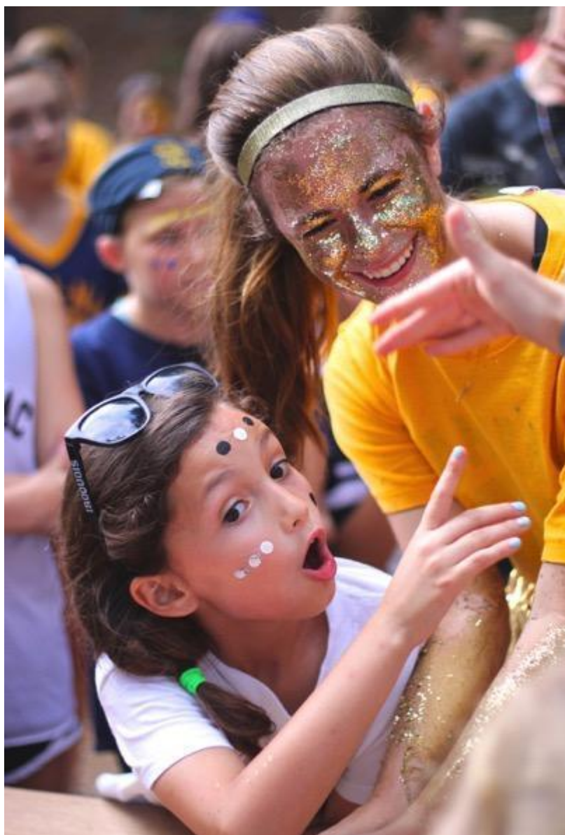
Things getting serious during the Gold Rush

Both campers and staff are expected to maintain a neat, clean-cut appearance at all times. Merri-Mac and Timberlake are special places, and we do have an “official” dress code on opening days and an informal one at all other times. Because of foot injuries in our mountainous terrain, flip-flops and other sandals without heel straps are not allowed in camp outside of the cabin (Ex: Teva’s and Chaco’s are ok, Reef’s, Rainbow’s are not). Also, girls, please remember that one-piece suites are required and modesty is appreciated.