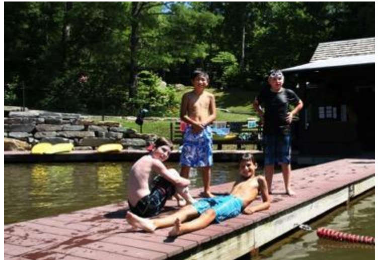
Relaxing on Lake Doris